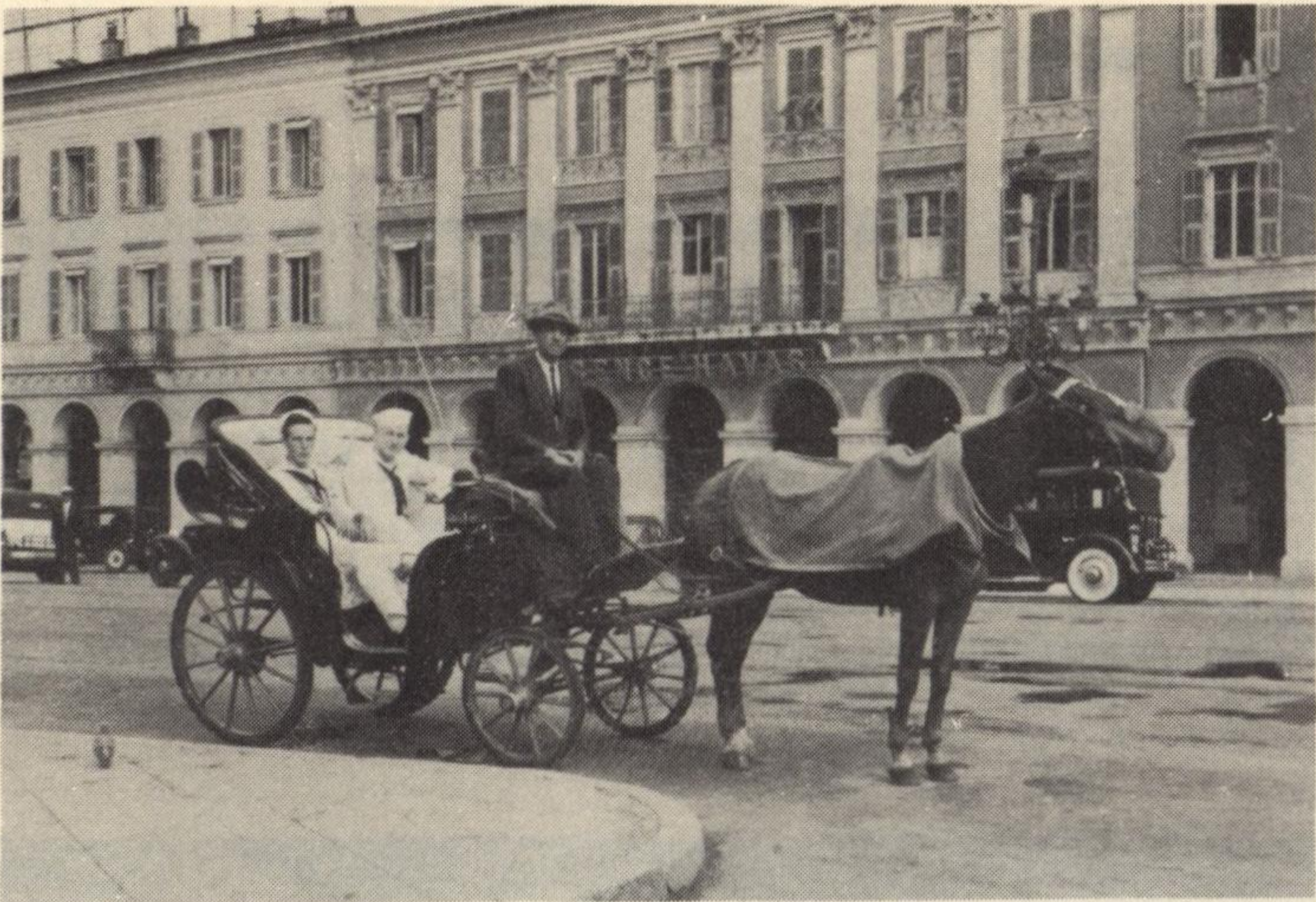
How to get around in Nice. Transportation de la hayburner