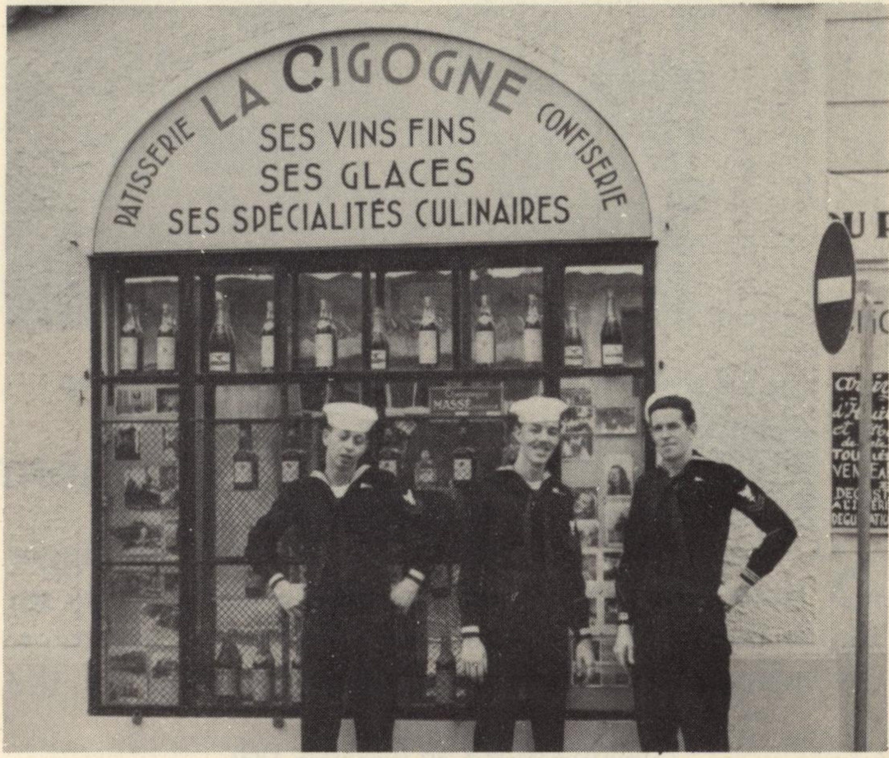
Hey, Doc, what ails ya?