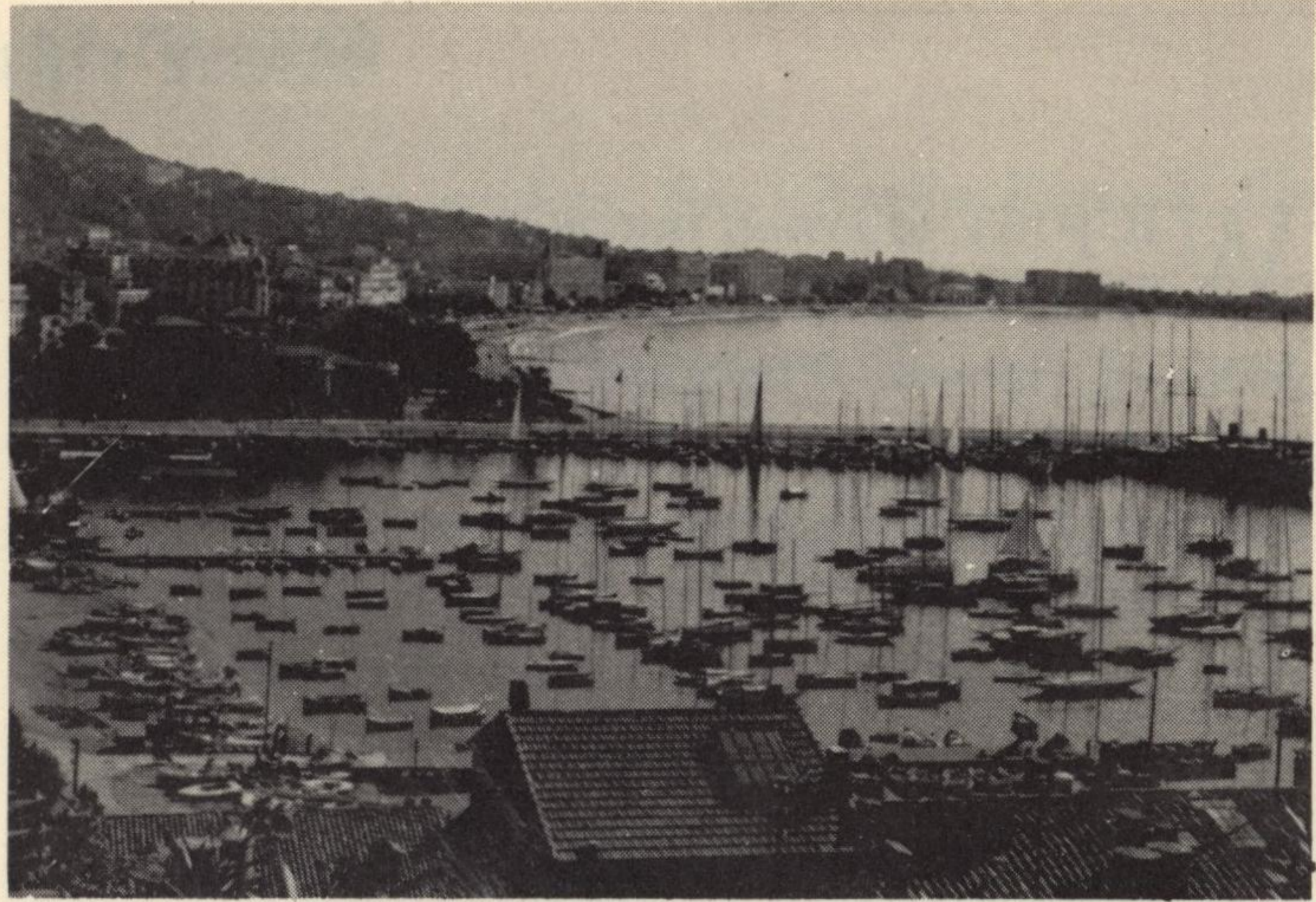
The Cannes Boat Basin

So off we trooped, up and down, over, under and around. We hit 'em all and had a ball. The girls were fine, they didn't mind, if John Q. Whitehat made some time.