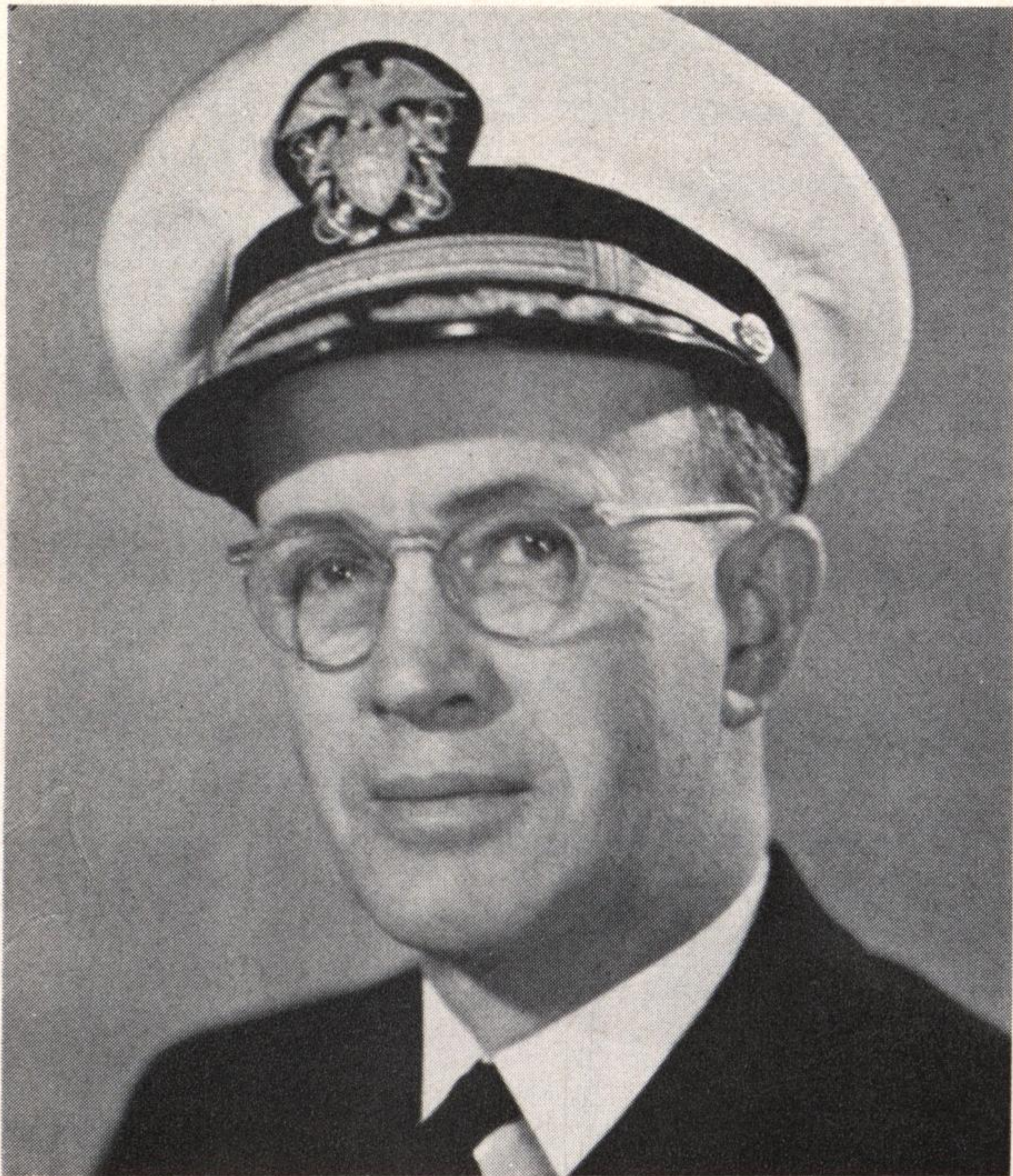
Rear-Admiral R. B. Carney