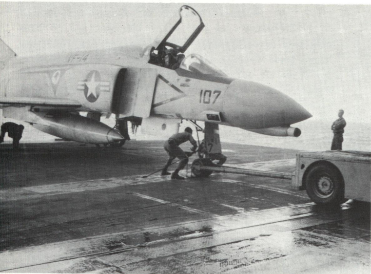
Fast Tiedown — Crenshaw, AN