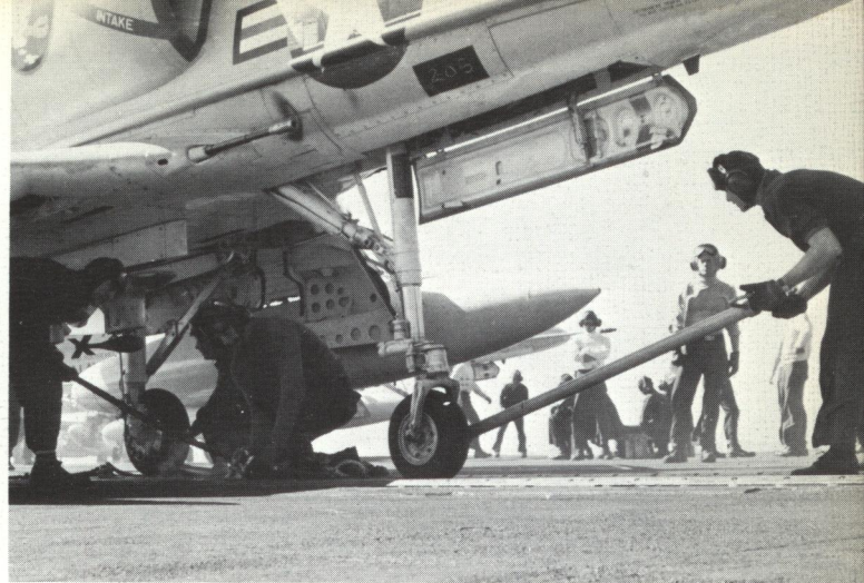
Catapult Spotting — Worth, AN