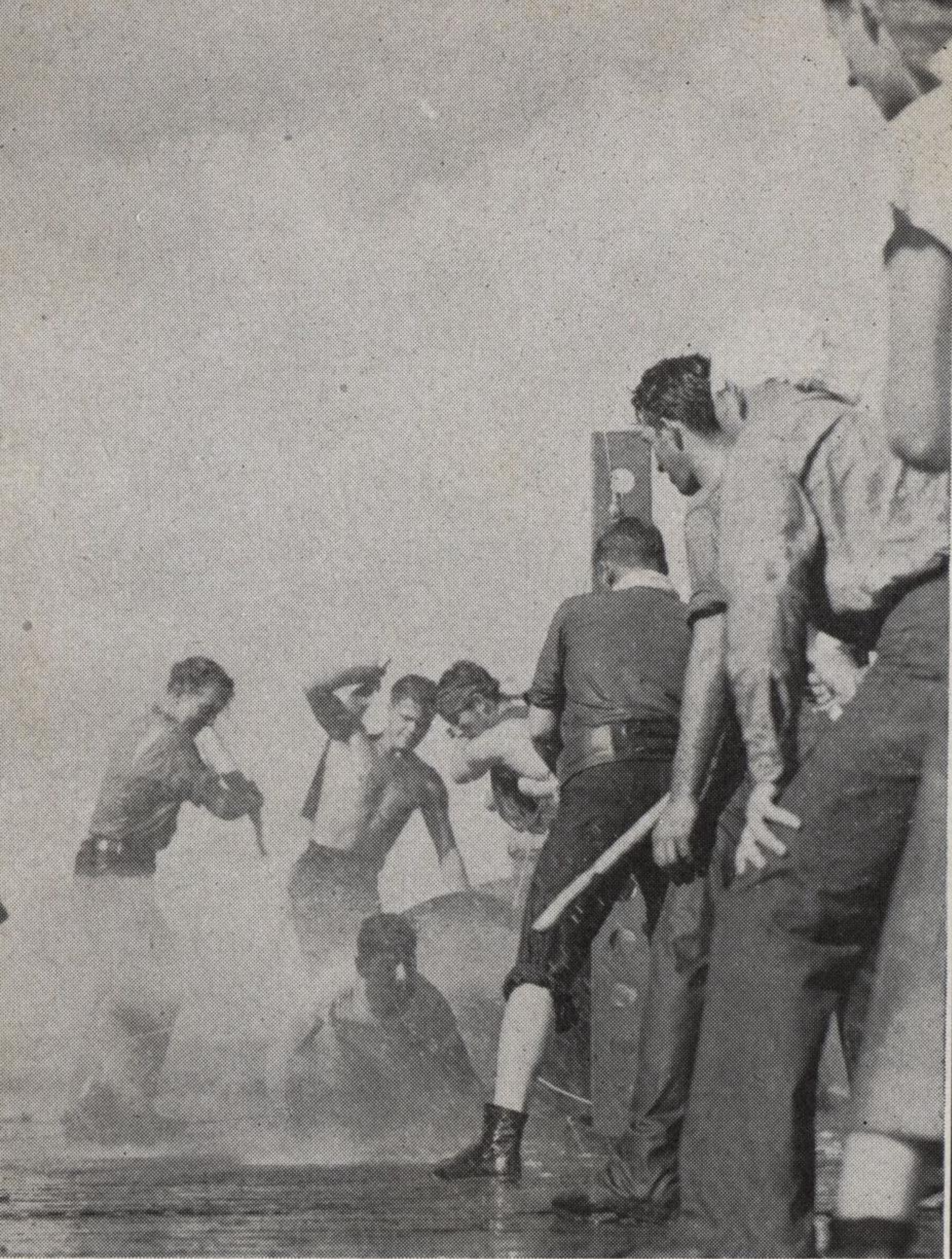
"Take it easy, bub!"