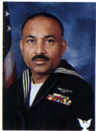
PN1(AW) B.S. Boyal

The ship's Enlisted Distribution and Verification Report (EDVR) is an important tool used in accomplishing this goal but even the best tools require skilled craftsmen to get the most out of them. The personnel office are the master craftsmen onboard when records are involved.