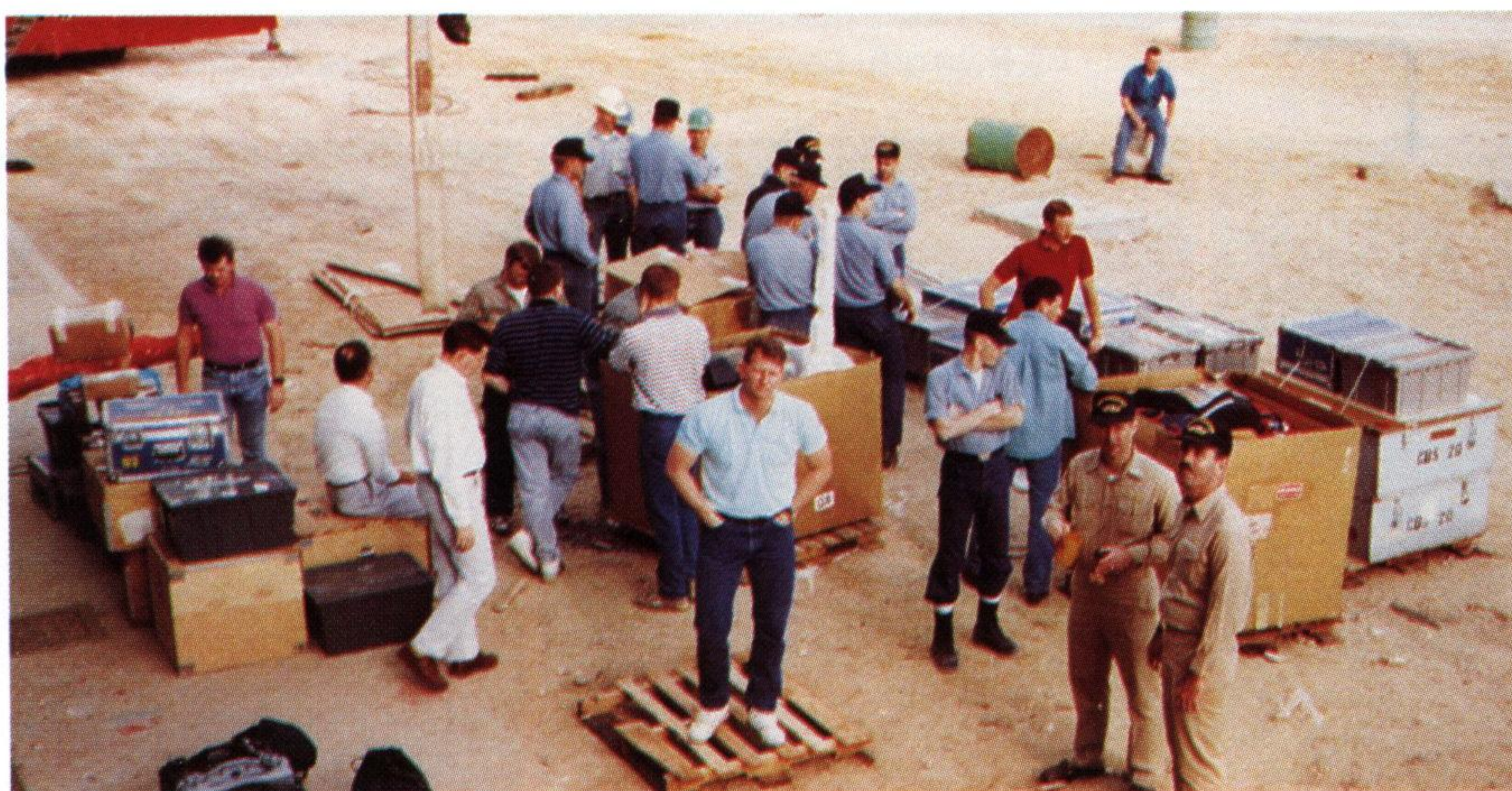
CDS-20 offloads unexpectedly in Dubai