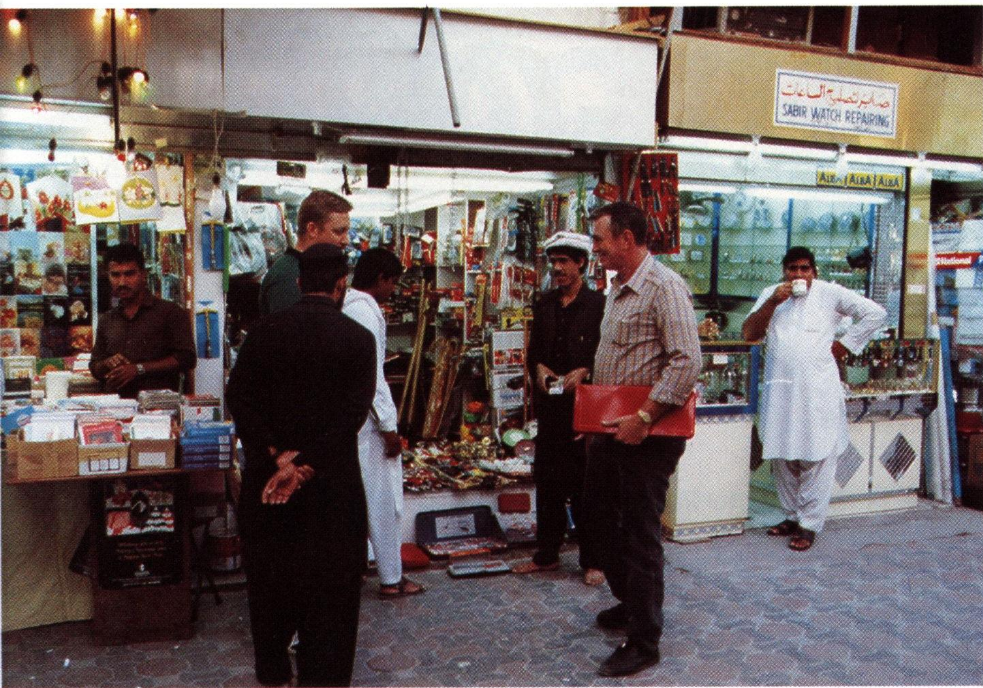
Shopping for bargains in Abu Dhabi's Souk