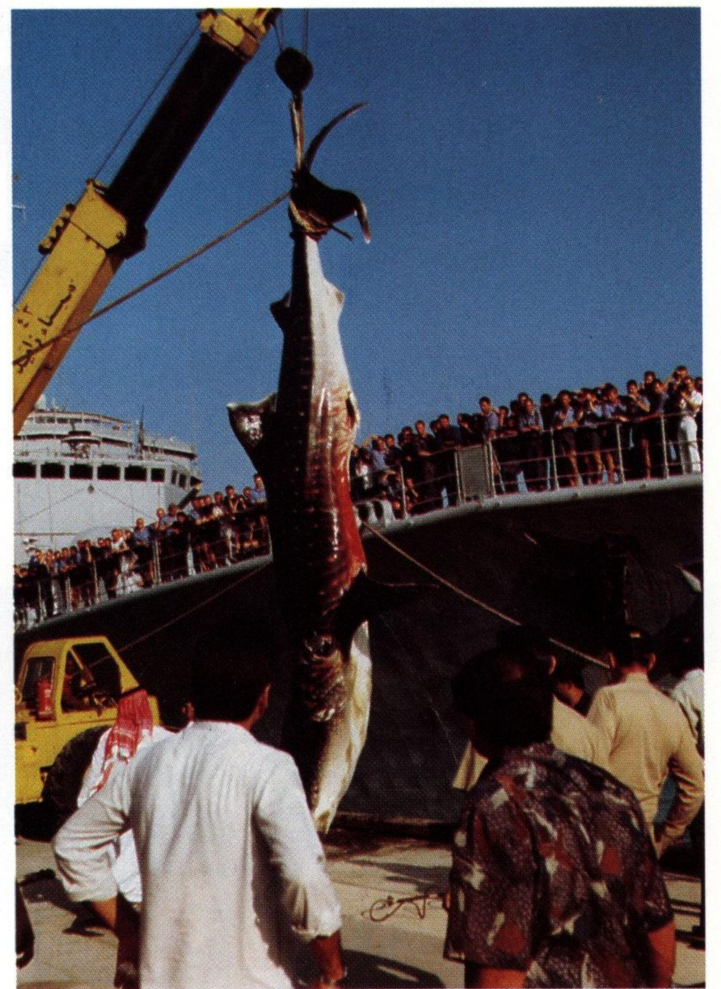
"The one that didn't get away": Whale Shark in Abu Dhabi