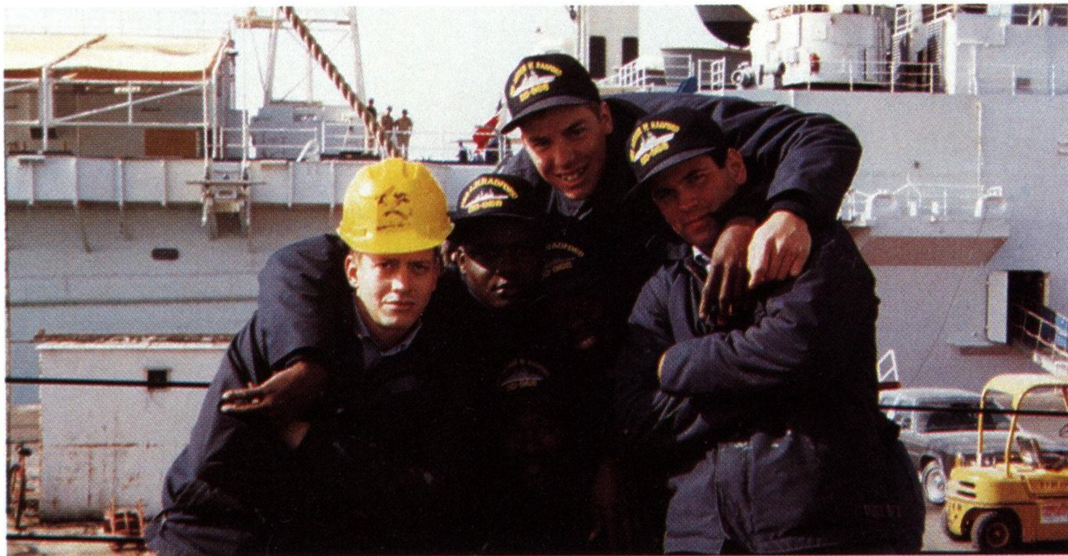
"We're not just close; we're shipmates!"